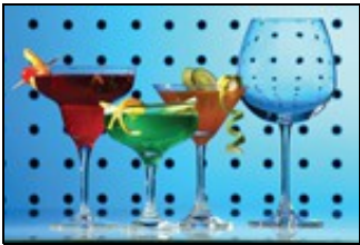
Food and Beverages